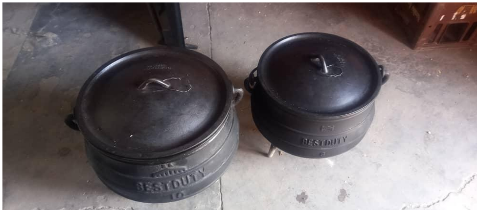
Soup kitchen cooking pots provided by the Foundation.

The Foundation supplied a fridge, cooking pots, cups and plates and recently sent funds for the construction of a shelter for the cooking pots and providing a water supply to the kitchen.