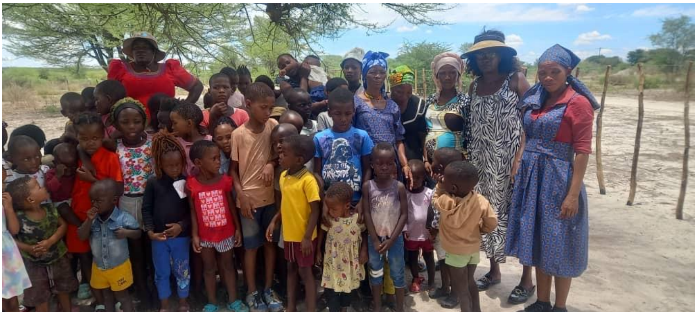
Some of the lucky recipients of the soup kichen