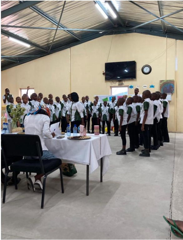
The choir at a previous competition