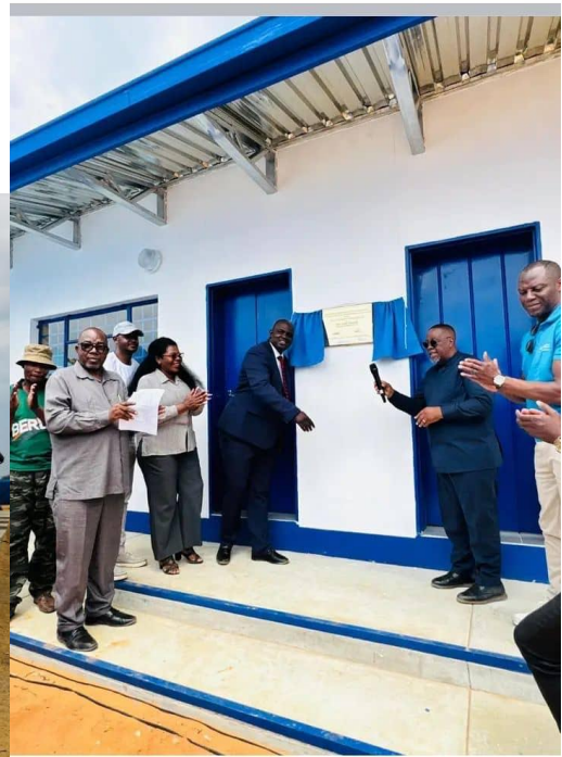
The opening ceremony