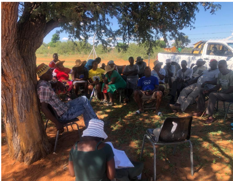
The community held a meeting to discuss the situation

At the end of November, the engine that drives the pump for the community borehole failed after fifteen years use which left the village without a water supply. The Foundation was contacted to see if we could be of any help with the purchase of a new engine. It was agreed that whatever the community raised, we would fund the balance which we did, and the new engine was installed on the 10 December.