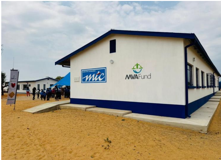
One of the new classrooms.

In our Spring newsletter we reported that MTC, a major mobile phone and network provider had agreed to build classrooms and an administration block. We were told that our involvement with the school was one of the factors that MTC choose the school. We are pleased to tell you that the building work is complete and the facilities were opened on 24 September