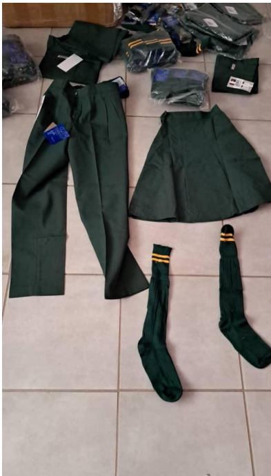
Some of the uniform items provided by the Foundation

The Foundation has funded the purchase of 166 school uniforms for the San children whose parents cannot afford them.