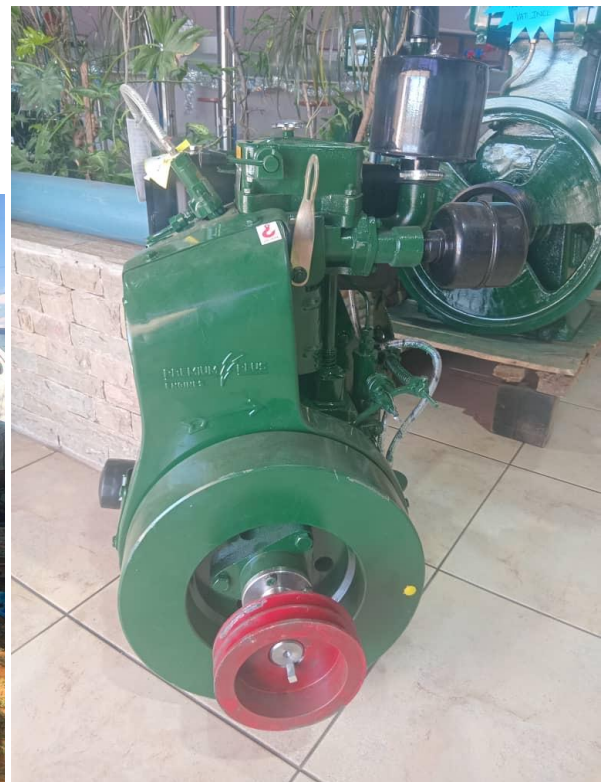
The new engine ready to install